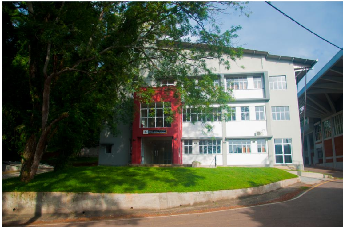
The UMCSAWM Building, located beside the Civil Engineering Building Complex